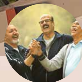
Senior citizen's corner