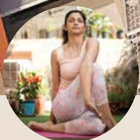
Yoga Meditation Zone