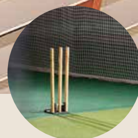
Mini Sports Turf