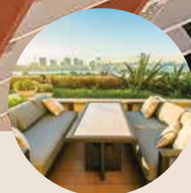
Lounge Seating Area